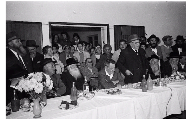
Residents of Kfar Chabad greet [Israeli] President Zalman Shazar in 1963. Photo and caption via Chabad website.

al-Safiriyya was destroyed in 1948; construction of Kfar Chabad began in 1949.