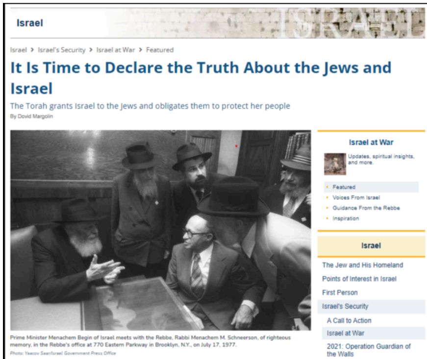
Chabad having a normal one

Palestinians are framed then, in Chabad's ideology, as agents of disease —foreign bodies invading and attacking healthy Jewish tissue. The movement for liberation is an infectious scourge that must be obliterated entirely, leaving no troublesome cells behind to reproduce and regroup. And these teachings of the rabbi are not some dark secret, or a relic of a different time that no longer represents the position of the organization. Rather, Chabad continues to promote the rabbi's writings on Israel as holy wisdom. The bacteria analogy above is included in a recent featured post on the Chabad website written in defense of Israel's indefensible actions in Gaza.