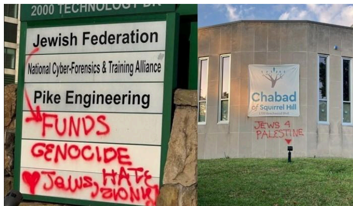
Vandalism of the Jewish Federation sign (left) and the Chabad of Squirrel Hill (right). The JFed sign states “Jewish Federation FUNDS GENOCIDE, ♥ Jews, HATE ZIONISM.” The Chabad graffiti states “JEWS 4 PALESTINE ♥”

If you were not already aware of this action, you will not be surprised to learn now that it made a lot of people very angry.