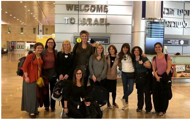
Photo published in the Pittsburgh Jewish Chronicle. Original caption: Momentum's Pittsburgh cohort in 2018 (Photo courtesy of Chani Altein)

Rebbetzin Altein's Momentum trips are customized specially for yinzers to include a two-day stopover in Karmiel , one of Pittsburgh's "sister cities." Located in northern Israel, Karmiel got its start in 1964 when it was built over the ethnically cleansed Palestinian villages of Bi'na , Deir Al Asad , and Nahf as part of Israel's plan to " Judaize the Galilee ."