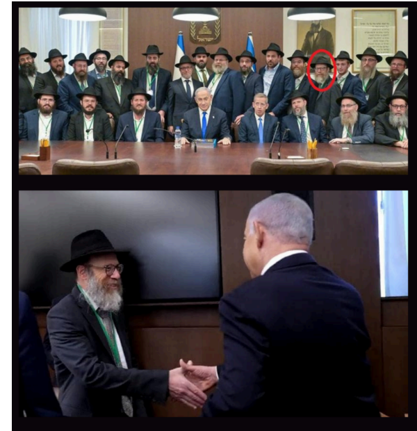
Rabbi Shmuel Weinstein of Chabad at Pitt meets war criminal Benjamin Netanyahu in July 2024

Sara Weinstein posted a few pictures from the meet and greet on Instagram, noting in the caption that meeting Netanyahu was a “ highlight ” for her husband.